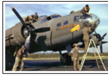
LIFE: WWII Allied bombers and crews