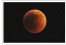
Volcano ash turns Asian eclipse blood red