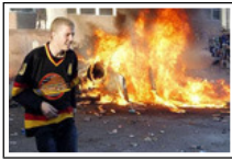
Vancouver violence after Stanley Cup loss