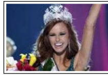
Miss California wins Miss USA crown